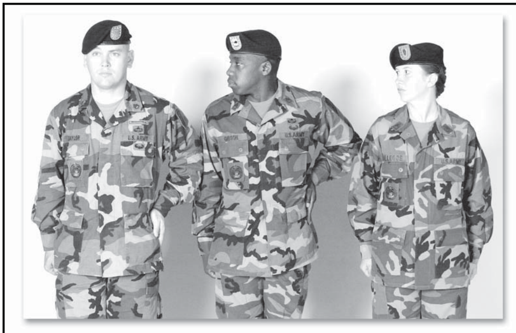
Figure 6-3. Alignment (Close Interval).

c. To align the squad at Double Interval , the commands are At Double Interval, Dress Right, DRESS and Ready, FRONT . These commands are given only when the troops are unarmed or at Sling Arms . On the command of execution DRESS , each member (except the right flank man) turns his head and eyes to the right and aligns himself on the man on his right. At the same time, each member (except the right and left flank men) extends both arms and positions himself by short steps right or left until his fingertips are touching the fingertips of the members on his right and left. (The right flank man raises his left arm; the left flank man raises his right arm.)