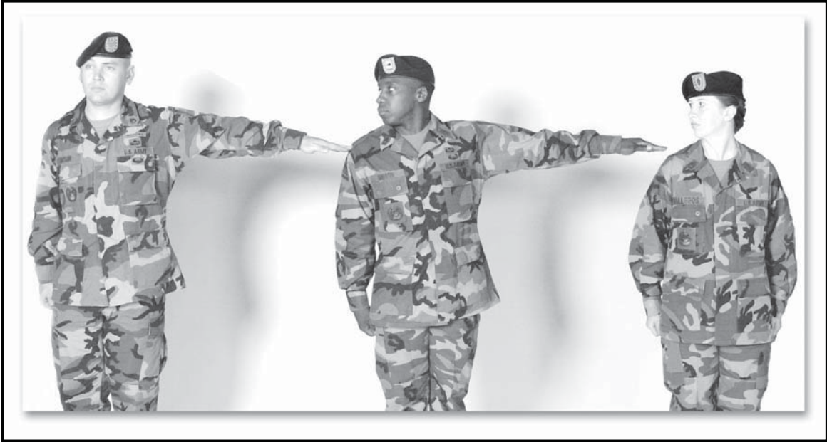
Figure 6-2. Alignment (Normal Interval).

NOTE: If the squad leader wants exact alignment, on the command of execution DRESS , he faces to the Half Left in marching and marches by the most direct route to a position on line with the squad, halts one step from the right flank man, and faces down the line. From his position, he verifies the alignment of the squad, directing the men to move forward or backward, as necessary, calling them by name or number: “Private Jones, forward 2 inches;” “Number eight, backward 4 inches.” The squad leader remains at attention, taking short steps to the right or left as necessary to see down the squad. Having aligned the squad, he centers himself on the right flank man by taking short steps left or right. He then faces to the Half Right in marching, returns to his position (center of the squad), halts perpendicular to the formation, faces to the left, and commands Ready, FRONT . These procedures also apply when aligning the squad at close or Double Interval .