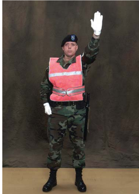
Figure 191-376-5107-12 Stop Traffic From the Front