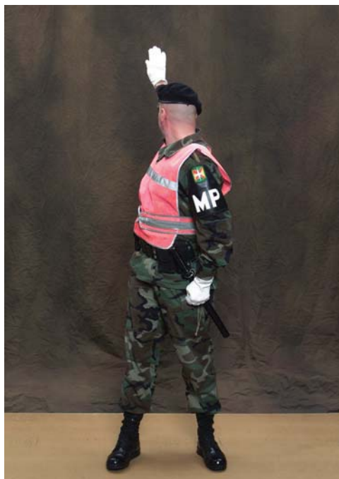
Figure 191-376-5107-13 Stop Traffic From the Rear