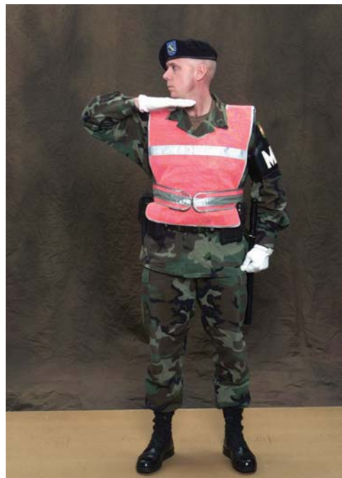
Figure 191-376-5107-3 Direct Right Traffic Straight Ahead, Graphic 2