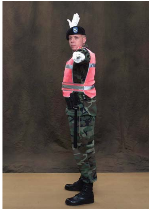
Figure 191-376-5107-10 Halt Traffic From the Right