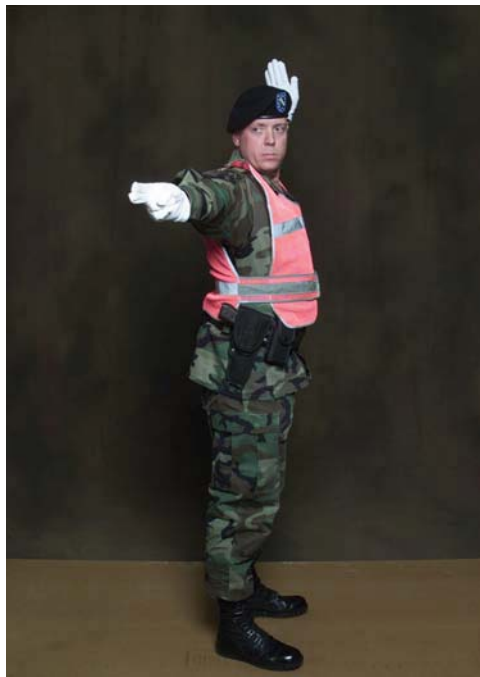
Figure 191-376-5107-9 Direct Traffic From the Right to Turn Left