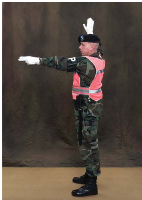
Figure 191-376-5107-11 Direct Traffic From the Left to Turn Left