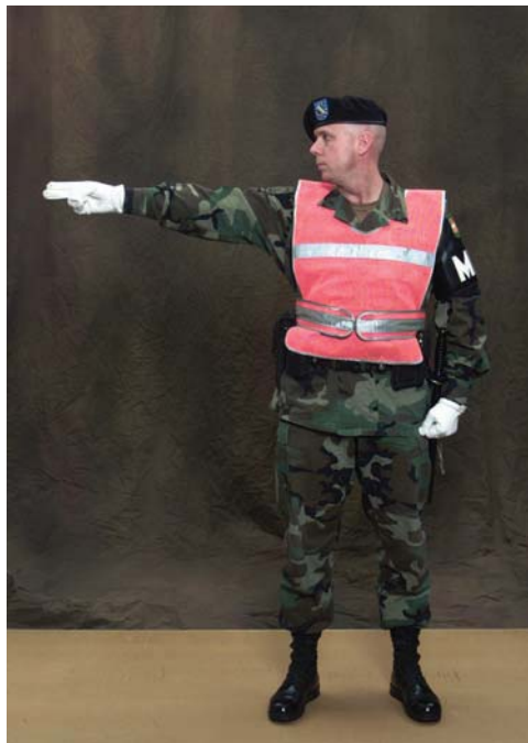
Figure 191-376-5107-4 Direct Right Traffic in Right Turn, Graphic 1