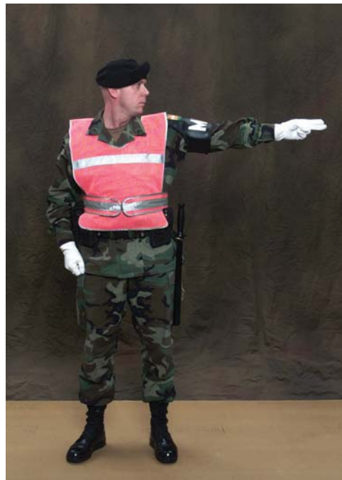
Figure 191-376-5107-6 Direct Left Traffic to Turn Right, Graphic 1