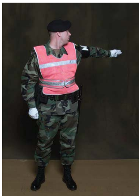
Figure 191-376-5107-7 Direct Left Traffic to Turn Right, Graphic 2