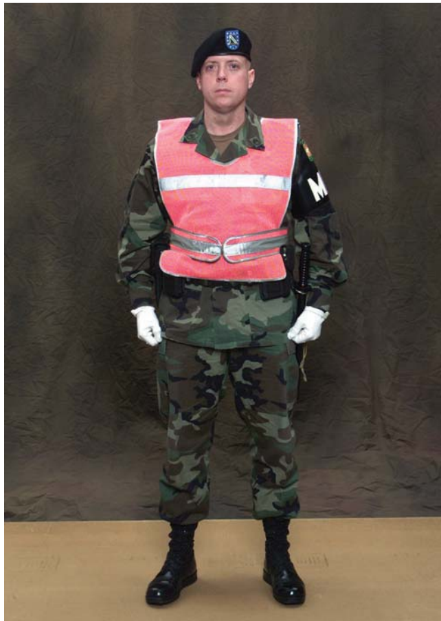
Figure 191-376-5107-1 Basic Stance for Traffic Control