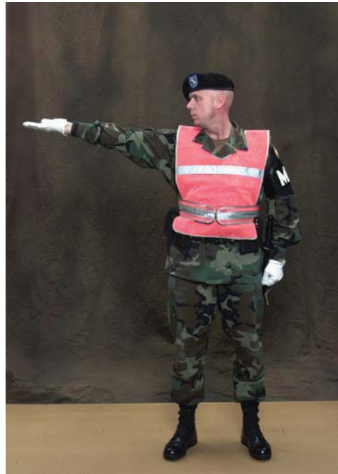
Figure 191-376-5107-2 Direct Right Traffic Straight Ahead, Graphic 1