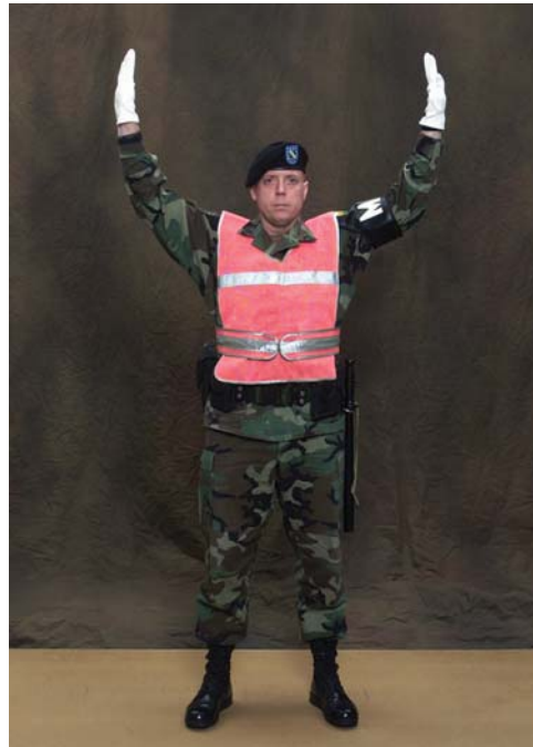
Figure 191-376-5107-14 Stop Signal for Both Right and Left Traffic